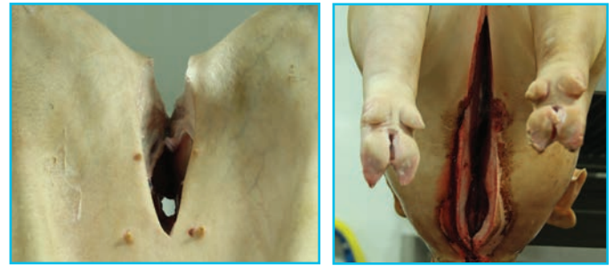
In one automated process, the stick wound is opened, and, simultaneously, the bung is dropped, the hams are separated and the pubic bone is opened